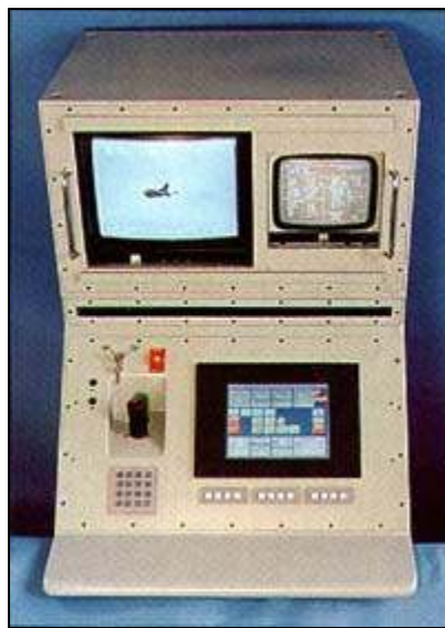
Original Radamec System 2500 EO Tracking and Fire Control System Operator's Terminal