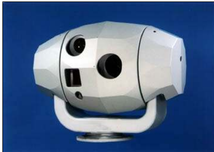
Ultra Electronics Series 2500 Electro-Optical Gun Control System