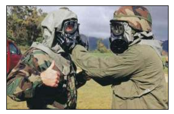
U.S. troops mask up in preparation for a chemical/biological agent attack.

sensors in an affordable and efficient manner and defeat target acquisition devices, missile guidance, and directed energy weapons, all of which can operate from the visible spectrum through the microwave portion of the electromagnetic spectrum. Notably, the dissemination systems incorporated into these materials will be designed to be safe and environmentally acceptable.