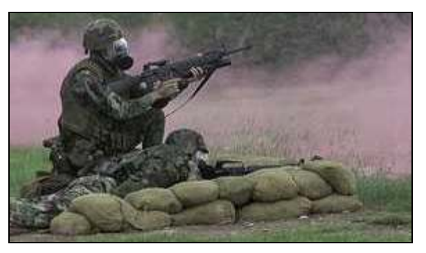
Fighting Battlefield Obscurants with Technology