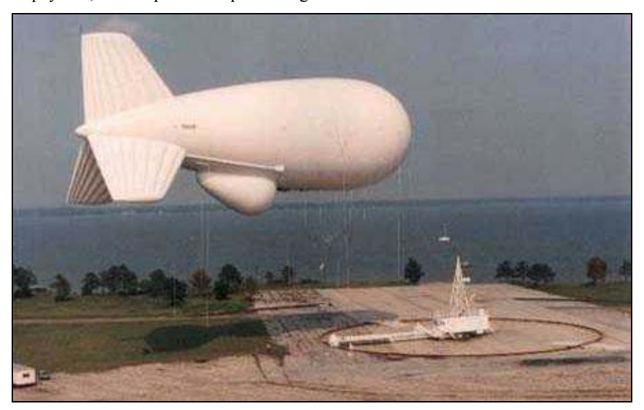
The JLENS consists of an aerostat equipped with advanced radar systems.

The JLENS Spiral 3 system measures up to 70 meters (230 ft) and carries its payload at altitudes up to 15,000 feet. Like the Spiral 2, a single Spiral 3 aerostat carries both precision track and surveillance radars. The U.S. Army reports that the Spiral 3 is untethered. The Spiral 3 would provide the Army and joint forces with the ability to employ interceptor weapons against sophisticated cruise missile and aircraft threats at long ranges.