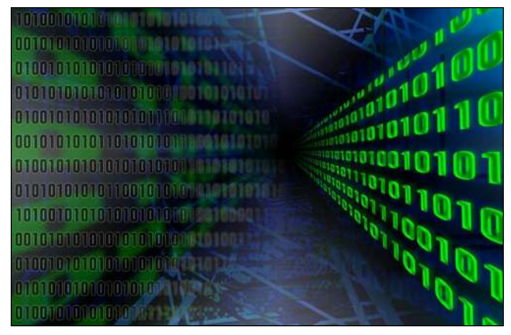
Information Decision Making Technology is a project of the U.S. Air Force.

need for re-planning across a degraded operational environment to be determined. In FY19, this subproject will initiate research and development of multi-domain command and control technologies. Also, it will seek to determine how to apply machine learning techniques to enhance and optimize space operations.