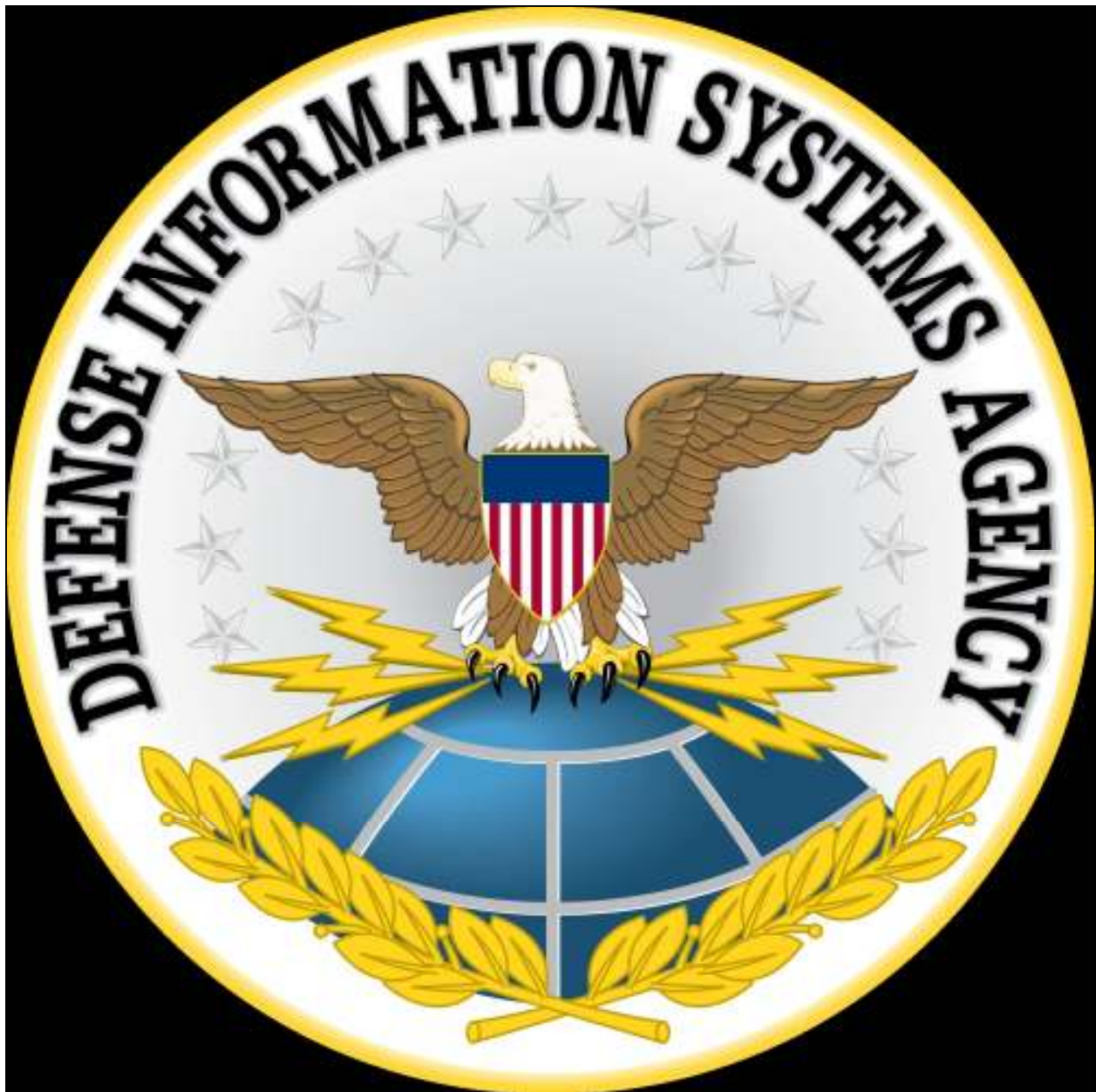
Net-Centric Enterprise Services is a U.S. DISA program

User Access. The User Access capability provides the user with secure Web-based access to NCES as well as a single launch point to access NCES services, but it is not the only method used to access NCES services. The User Access capability also provides a flexible profiling and customization capability for capturing, managing, and acting on a full array of user preferences.