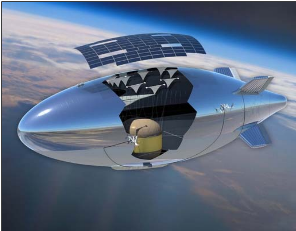
Integrated Sensor Is Structure (ISIS) Rendering

DARPA states that ISIS will have the capability to track cruise missiles with an air moving target indication range of 600 kilometers (373 mi) and dismounted enemies with a ground moving target indication range of 300 kilometers (186 mi). ISIS will have an airspeed of 60 knots sustained and will be capable of a 100-knot sprint. The entire system will have an approximate life-cycle of 10 years of autonomous, unmanned flight.