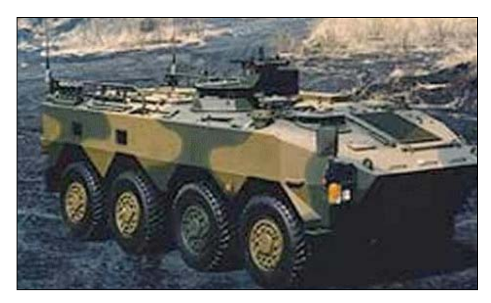
JGSDF Type 96 Armored Personnel Carrier