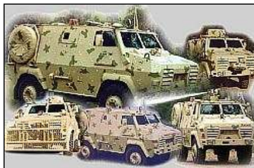
Shorland S600 Family of Vehicles

The vehicle can also accommodate other armament options.