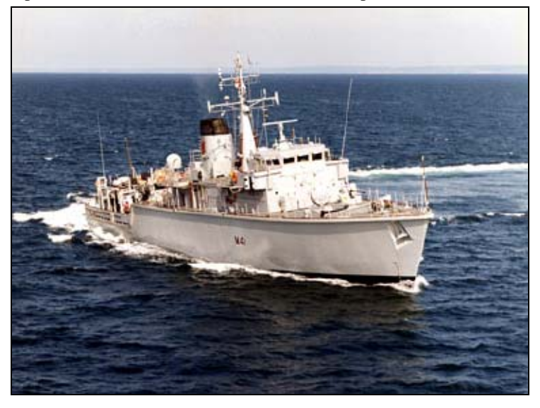
<u>HMS Hunt</u>, a mine countermeasures vessel, is an example of the platform ship equipped with the MSSA Mk1

used in conjunction with a magnetic towed sweep to destroy combined influence mines. A towed acoustic monitor is available if the system is operating in a closed loop.