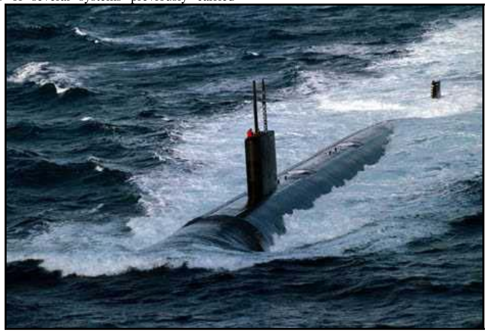
<u>USS Columbia</u> (SSN-771) is a U.S. Navy Los Angeles class submarine. This class is the primary platform installation for the BQN-17A

separately. This system reportedly incorporates major portions of BQN-17(V) technology. The SSN-21 Seawolf class submarines have a different depth sounder/fathometer.