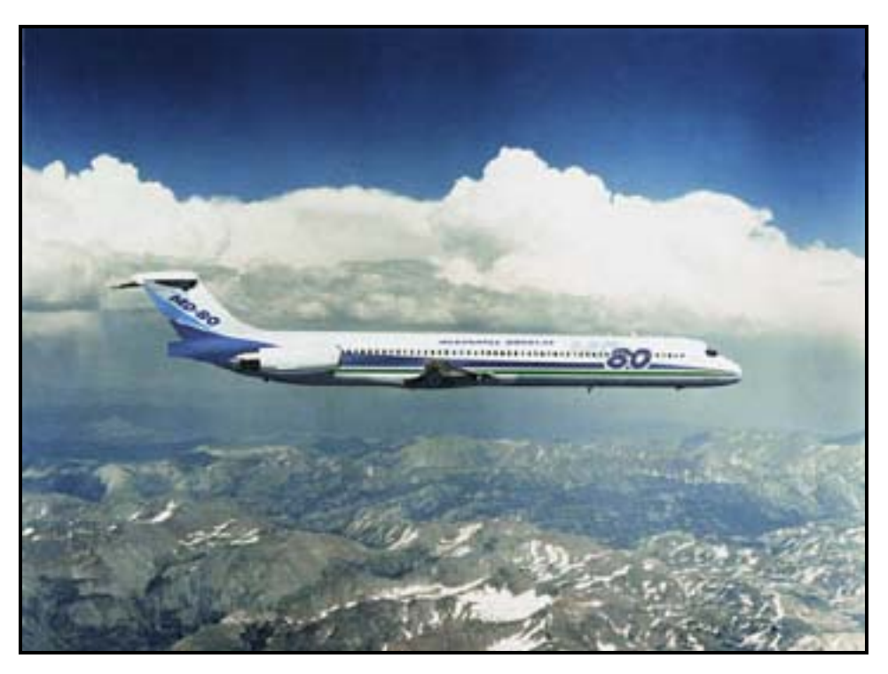
BOEING MD-80