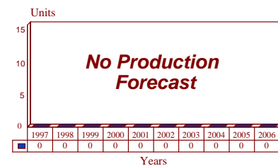
10 Year Unit Production Forecast 1997 - 2006